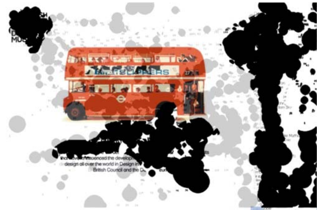
figure 2: Three areas in a webpage with most activity from first-time visitors to the design museum website. Original site: http://www.designmuseum.org/design/

The system provided mouse activity that was useful in understanding how users viewed a webpage and aided in identifying potential problems with a webpage. For instance, when evaluating a design website, participants found that activity concentrated on three main areas: website logo, website description and selection menu (see figure 2). Even though this is a simple webpage, there was some confusion about the site's interactivity. Most people attempted to interact with the website logo on the webpage, but it did not have an interactivity associated with it. Interestingly, the short website description was effective in getting people to read about it, being one of the most viewed areas. And finally, they discovered that people spent most of their time interacting with menus and selecting art designers to review. This was expected since menus are the only interactive part offered by the site.