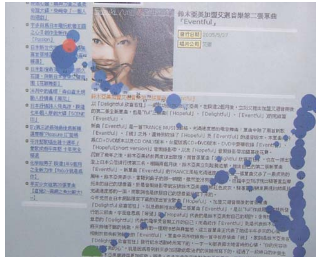
figure 3: Mouse trajectory indicating reading behavior. Ample radius show smooth movements in a vertical direction trough the paragraph. A big radius at the menu indicates hesitation before clicking on a menu item.